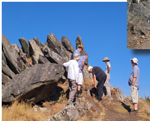
Altar Stones, Charnwood Forest

Our attention now turns to our winter programme of lectures which begin in October at the Cube. If you are interested in joining the group, then our website provides much more information, including details of our monthly talks. We are always open to new members – contact Roger Hunt at rmrhunt@sky.com