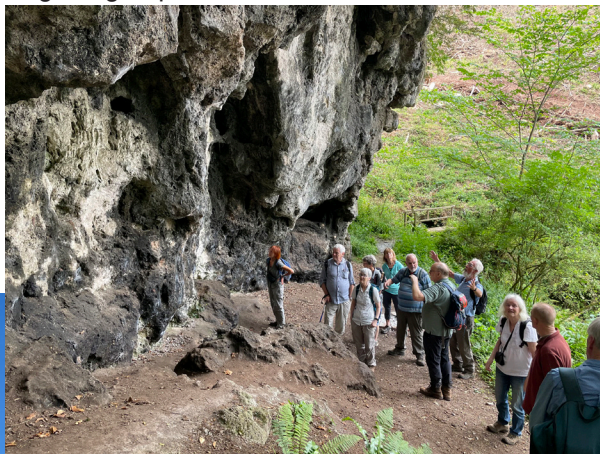
Southstone Rock, near Shelsey Walsh