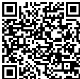
Arkansas Traveller (Solo)