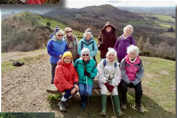
The Group's monthly walk in the Malvern Hills