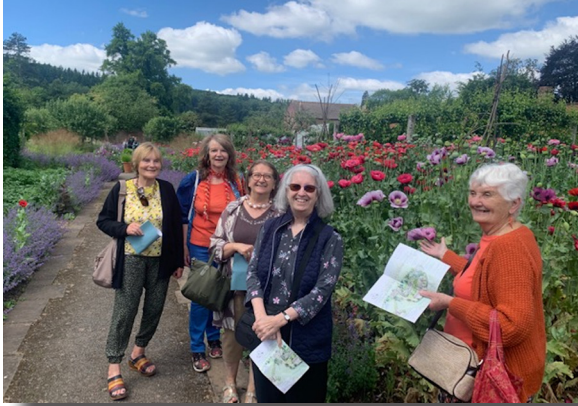
Solos Group members on a visit to Hampton Court Gardens in Herefordshire.