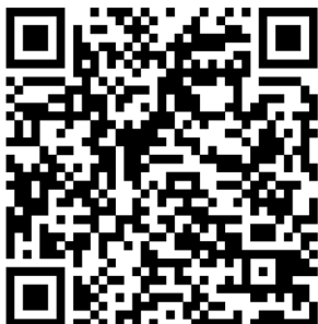
Danse Macabre (Group)