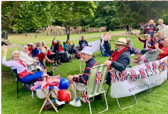
The Solos picnic in Priory Gardens - celebrating the Queen's Jubilee

There's a happy side-effect in our Solos groups - you can often find someone to join you to go to a function you want to attend, knowing you will enjoy it more with a friendly person to share the experience - and we're all very friendly.