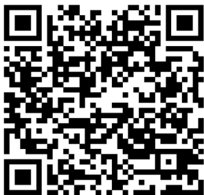
When I'm 64 (Strum and Sing Group)