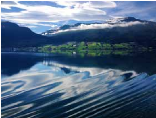
Neil Storey - Wave