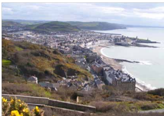
Aberystwyth from Constitution Hill, and ... ... looking towards the Hill and the 'bar'.