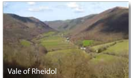
Vale of Rheidol

Wednesday was another glorious morning when the group took a trip on the "Prince of Wales" steam train on the Vale of Rheidol railway, the only narrow-gauge railway to have been owned by British Rail, but is now in private ownership. It