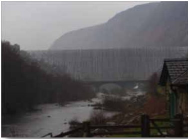
The Elan Valley Dam

On Monday 11 th April thirty-one people set off for Aberystwyth in driving rain which got steadily worse as the day progressed. A stop was made at the Elan Valley Visitor Centre. The dams are operated by Dwr Cymru (Welsh Water) and the centre overlooks the Victorian stone dam which holds the domestic water for Birmingham. The party then continued on to the university town of Aberystwyth where they booked into the Belle Vue Royal Hotel, with the rest of the day free to explore the town.