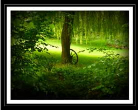
Lorna Blackwell - Green

Themes for members pictures this year have included Green, Wave, Relax and The Old & the New. The theme for May is 'Pattern'. In May we will look at 'Landscape Photography', (with a particular look at stacked and stitched images), and in June it will be 'Some projects for the Summer'.