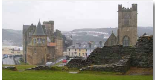
Aberystwyth and the old university from the castle

Tuesday was a much better day with wall-to-wall sunshine and the group travelled south to the pretty seaport of Aberaeron where most of the group watched as a crane lowered boats into the harbour ready for the summer season. Then there was a short drive from Aberaeron to Llanerchaeron House which is a villa designed by John Nash in the late eighteenth century for Colonel William Lewis. This has survived virtually unaltered and is now run by the National Trust. It consists of a minor gentry estate with a self-sufficient farm complex and kitchen garden.