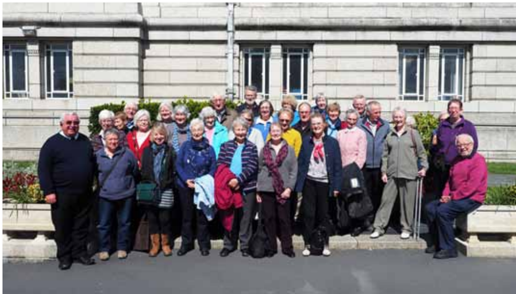
The group outside the National Library of Wales

was opened in 1902 to carry iron ore, timber and passengers. It runs between Aberystwyth and Devil's Bridge. It climbs nearly 200m in the twelve miles travelled, and passes through stunning scenery, often with red kites and buzzards circulating overhead, which indeed they did on the group's visit. Having spent some time in Devil's Bridge looking at the three-layered bridge and climbing down to the waterfalls, we returned to Aberystwyth to visit the National Library of Wales. The visit started with a short introductory film followed by a tour of some of the Library's oldest acquisitions, such as The Black Book of Carmarthen, a compilation of myths and legends of early Wales. Everyone was amazed at the amount of information stored in the Library, which includes a copy of every publication in the UK.