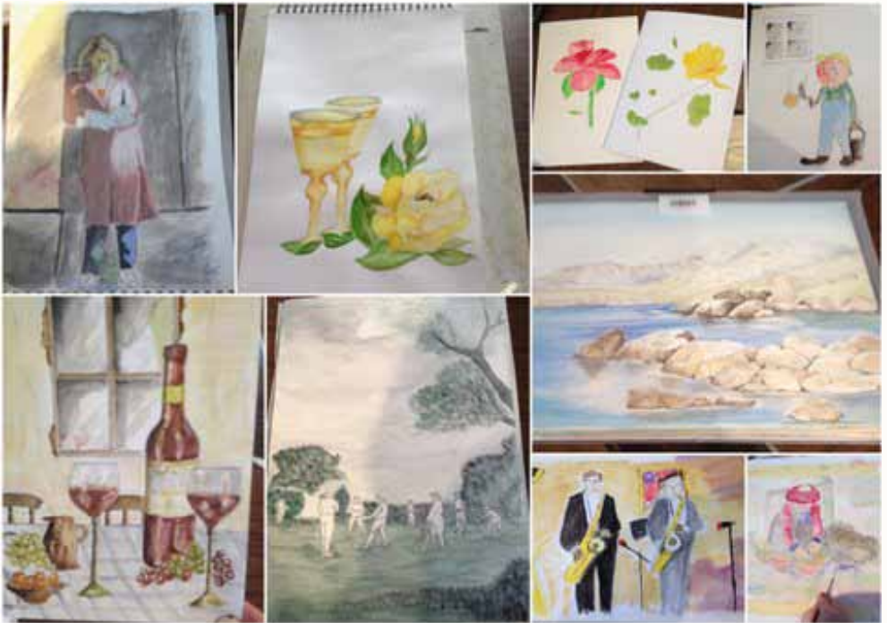
Recent work from the Painting 2 group