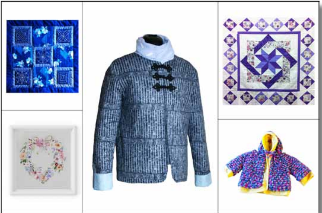
Recent work from the Needlework and Patchwork Skills group