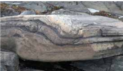
and to fill the space! Layered metamorphic rock at Ardchiavaig, Mull