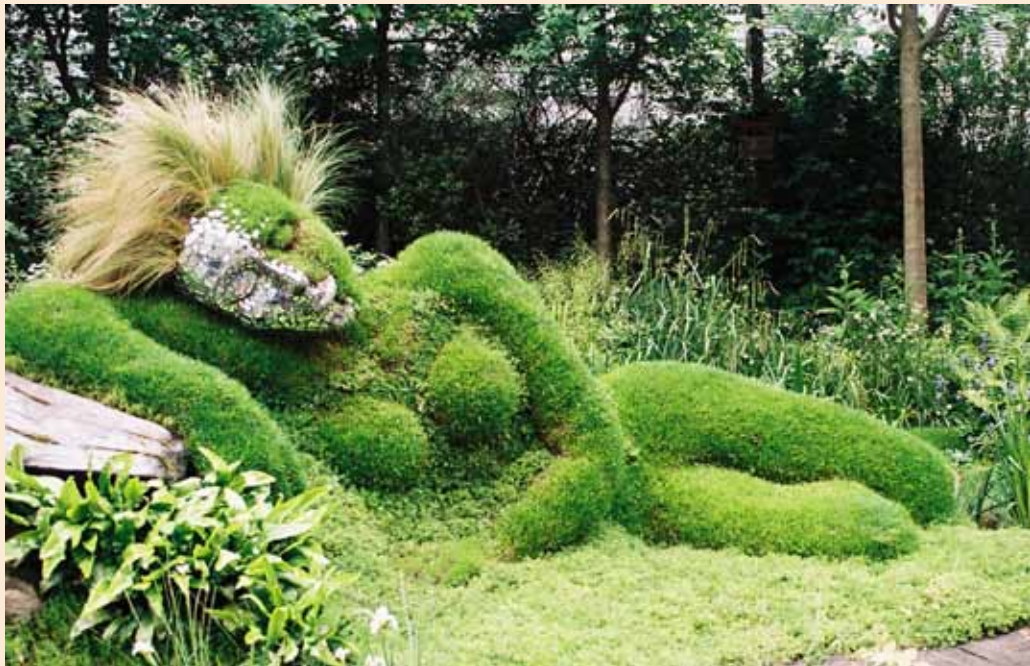
Sue Kershaw - Camera Group theme 'Green'