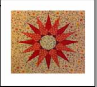
Examples of work from the Needlework Group