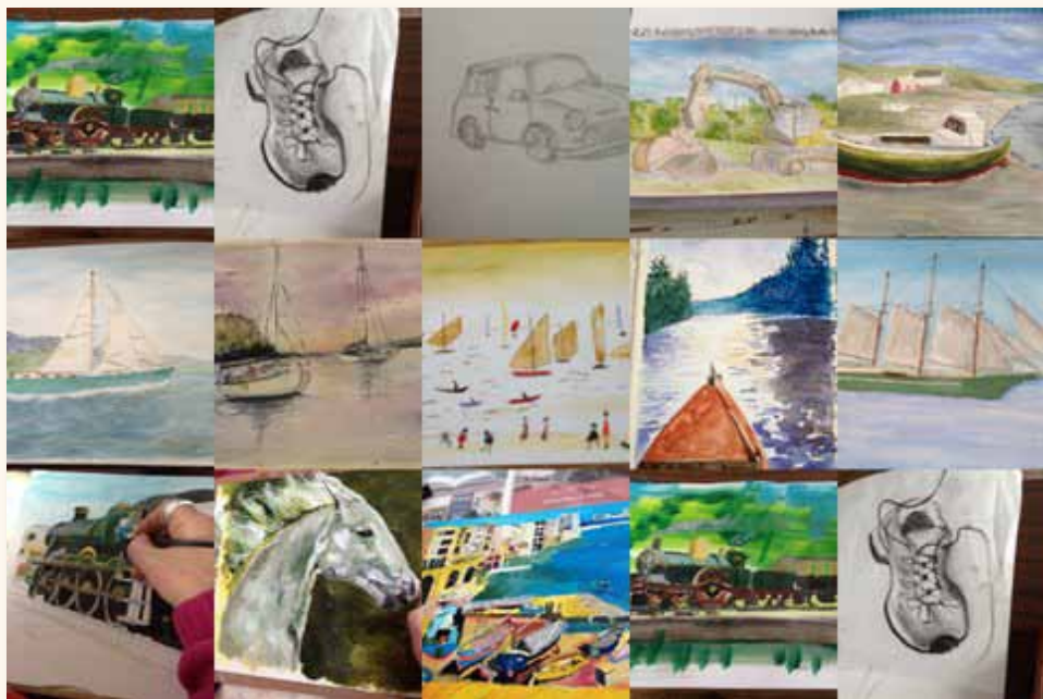
Images from Painting Group 2